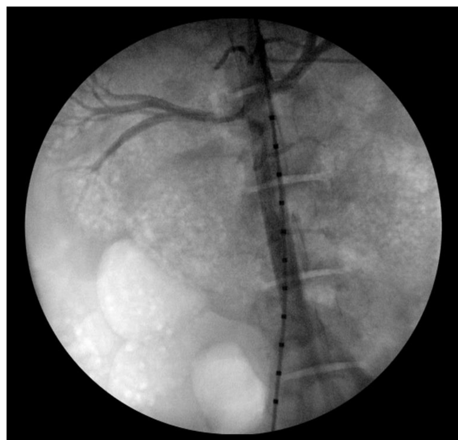
Figure 1. Using fluoroscopy, a catheter was guided into the abdominal aorta via the femoral artery. An angiogram was performed prior to dose administration and aortic dimensions were obtained.