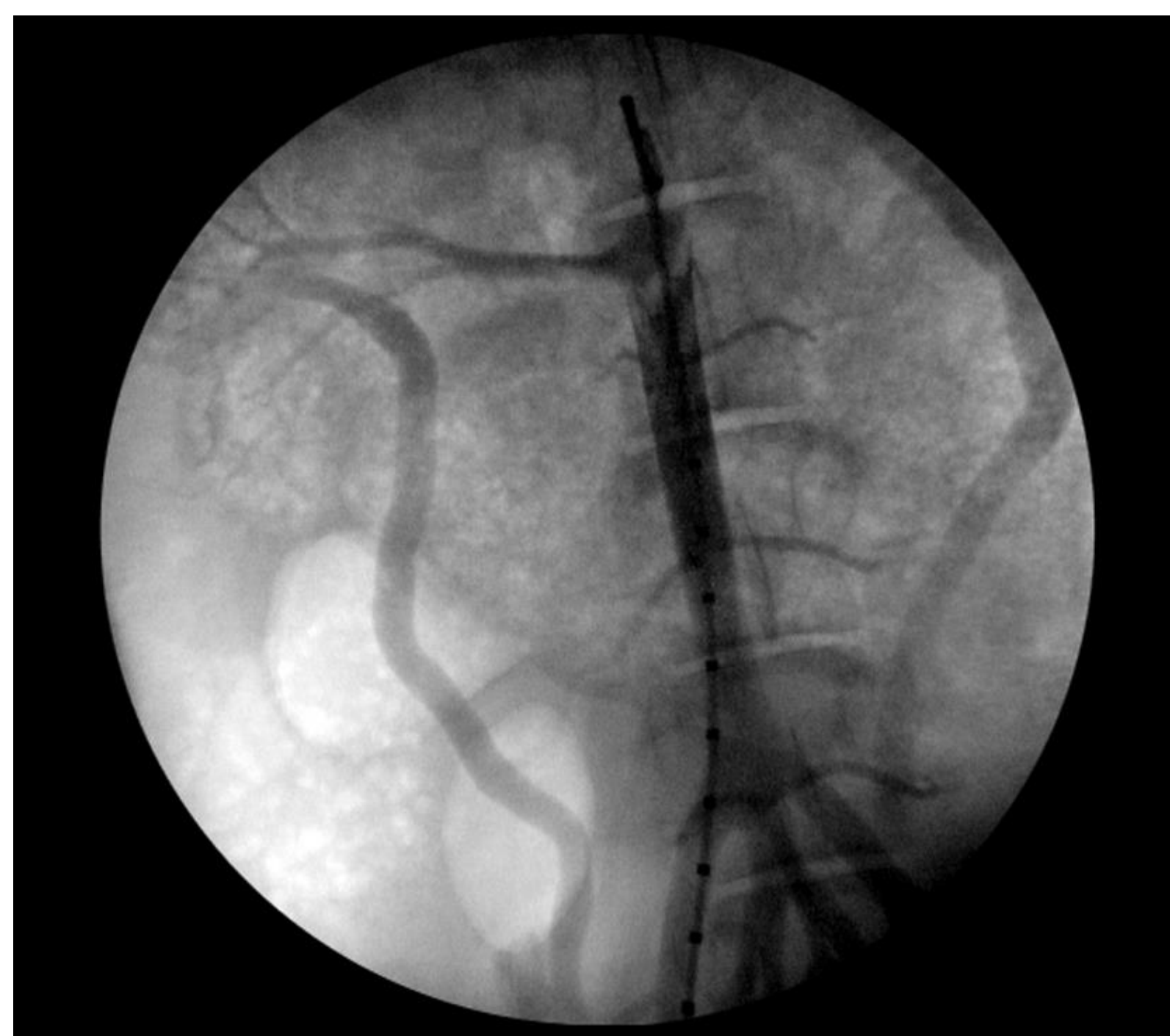
Figure 3. Using fluoroscopy, a catheter was guided into the abdominal aorta via the carotid aorta prior to scheduled termination and aortic dimensions were obtained. An antegrade angiogram was performed to avoid interaction with the treated aorta/dose site.